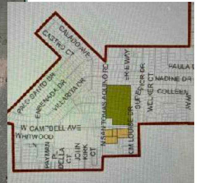
Campbell — 415+ units