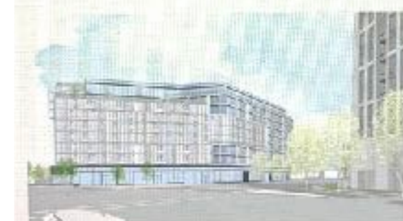
Architectural Presence at Major Street Intersection