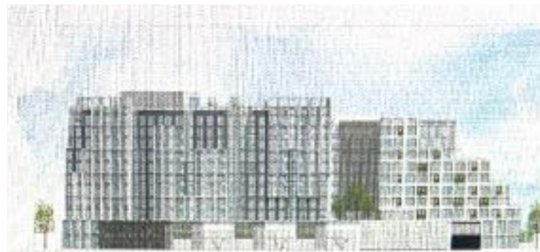
West Elevation -- Building 1