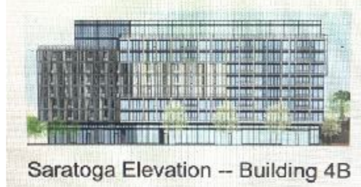
Saratoga Elevation -- Building 4B