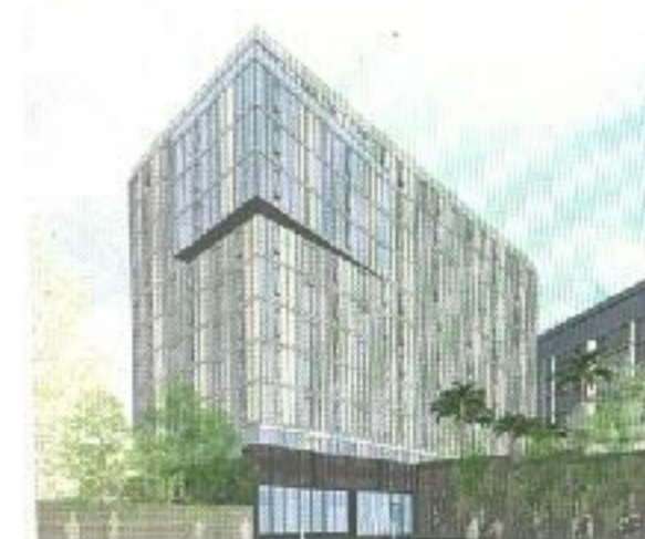
Affordable Residential Tower w/Entry Court