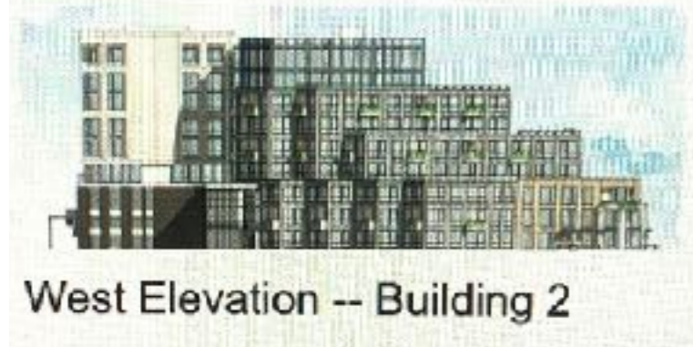
West Elevation -- Building 2