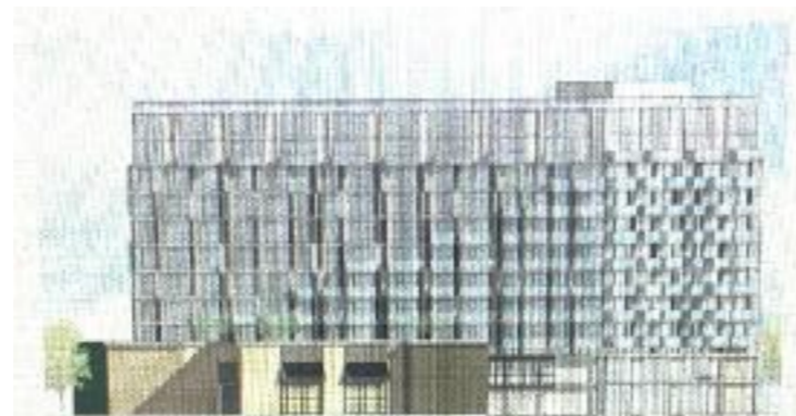
North Elevation -- Building 3